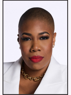
Symone D. Sanders Townsend

Symone rose to prominence in 2016 as the national press secretary for U.S. Senator Bernie Sanders's then-presidential campaign. At 25, she became the youngest presidential press secretary on record and was named to Rolling Stone Magazine's list of 16 young Americans shaping the 2016 election. At 29, she published her first book, No, You Shut Up: Speaking Truth to Power and Reclaiming America and served as a senior advisor for President Joe Biden's 2020 presidential campaign. At 31, Symone was appointed as a senior member of the Biden-Harris administration serving as Deputy Assistant to the President and Senior Advisor and Chief Spokesperson to Vice President Kamala Harris. With her White House appointment, Symone became the first Black woman to serve as a spokesperson to a Vice President. In 2022, she joined MSNBC to host SYMONE providing essential context on the most pressing issues facing Americans today.